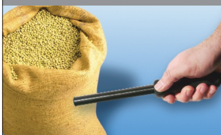
Hygrothermometer TFH 100