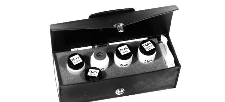
Calibration set EB 315-N

with humidity reference for Hygrometer TFH 100 11.1% rH 52.7% rH 75.4% rH delivered in a case