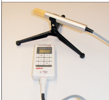
TFH 100 with tripod