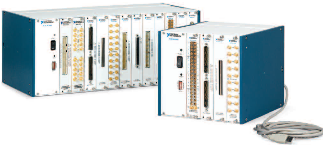
Figure 1. Expand channel count with USB-controlled switching.

You can easily integrate NI 4065 DMMs with stand-alone switching using the 4 or 12-slot USB Switch Mainframes from National Instruments. You can configure these switch systems, controllable from any available USB port on a PC or laptop computer, with more than 50 available SCXI switch topologies. For existing SCXI switch systems, the NI 4065 DMMs can also provide control via the AUX connector on the front of the DMM. Switching offers a simple method of channel expansion for data-logging systems based on an NI 4065.